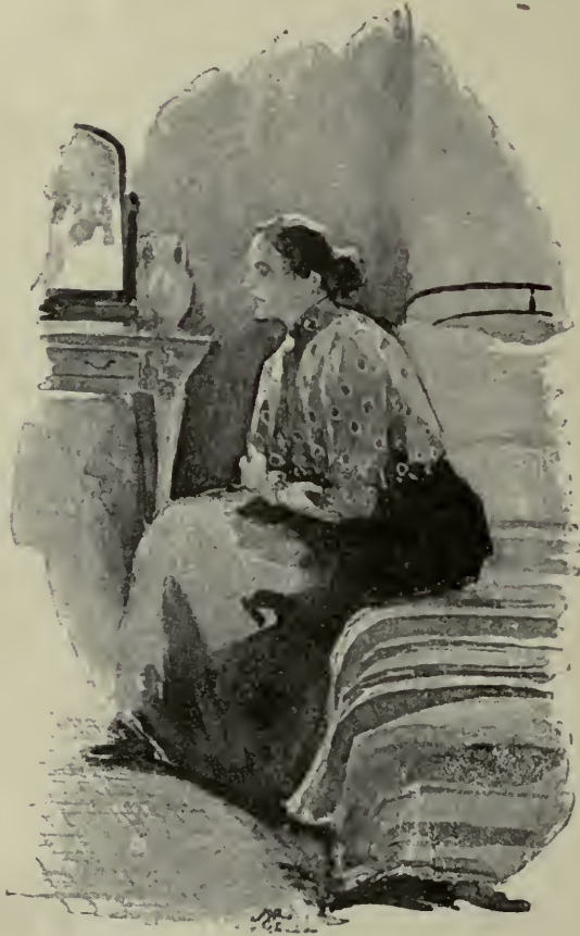
I SAT DOWN.

eaten, and, hanging upon the side of the tent, another looking-glass. The whole of one wall of the tent was occupied by a